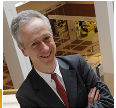
"A brilliant festival" - Jamie Byng, Canongate